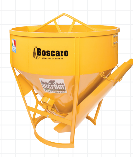
C-N Series Concrete Buckets