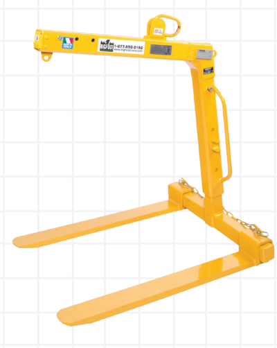
MBRA-E Series Pallet Forks