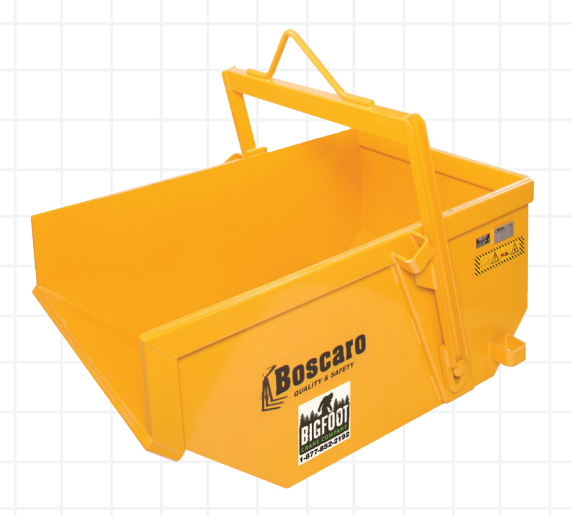
A-D Series Self Dumping Bins

Every Boscaro product is built to the highest standard and meets or exceeds ASME regulations. Call the Bigfoot Crane Company to learn how a Boscaro accessory will add value to your workplace.