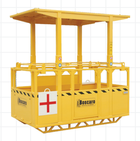
CPP Series Man Baskets